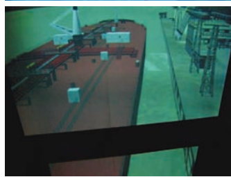
▲ Display Solutions uses an automated geometry alignment process in which the visual system is initially modelled in a simple CAD theatre-design package

CC-Cad, a PC-based program designed for model and terrain creation.